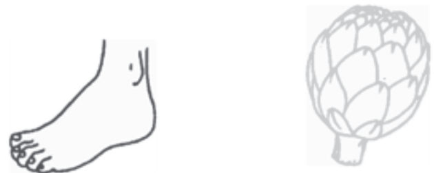
Figure 1. An example of the two pictures presented at the encoding phase

The dependent variable was RT. Table 2 shows the mean RTs (SD in parentheses) of the three groups in the simple and choice reaction-time tasks. The percentage of errors on both tasks was less than 1% with no significant differences among groups. Only RTs corresponding to correct responses were included in the analyses. RTs larger than 2.5 standard deviations from the participant’s mean were also excluded from the analyses.